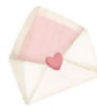
Invites $ _____