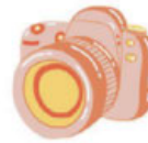
Photography $ _____