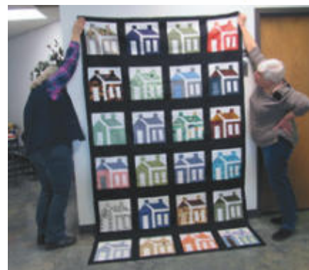
"Home Is Where the Heart Is" Quilt (60"x 98")