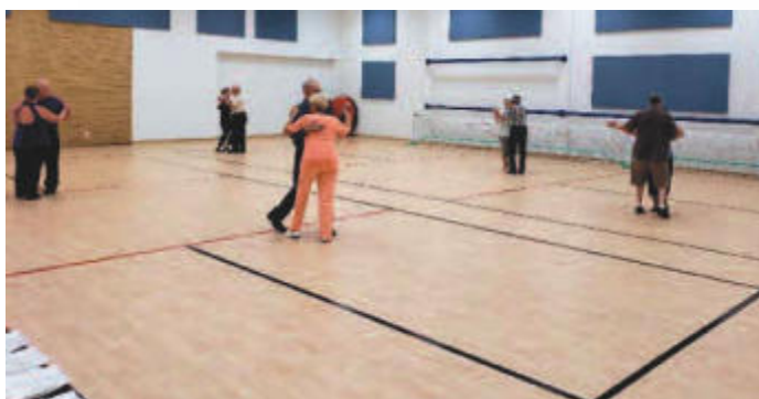
Monday Night Round Dance dancers.