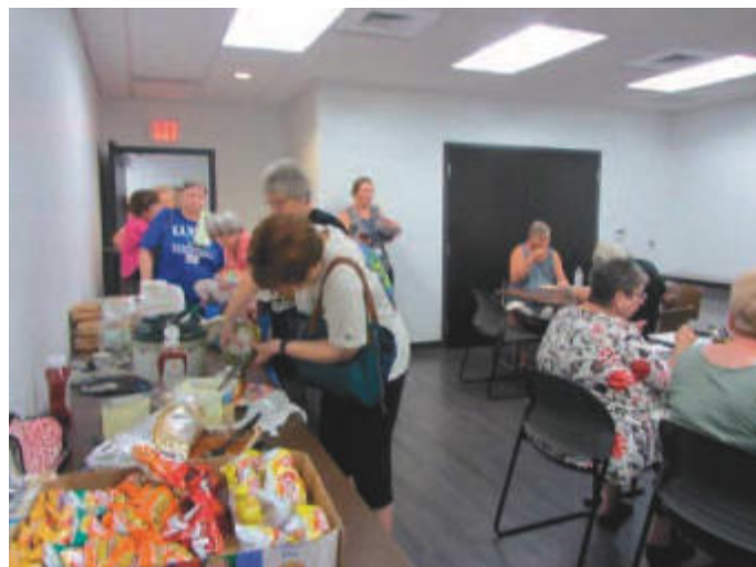
Members of the Downtown Senior Center enjoyed celebrating National Hot Dog Day with hot dogs and all the trimmings July 18.