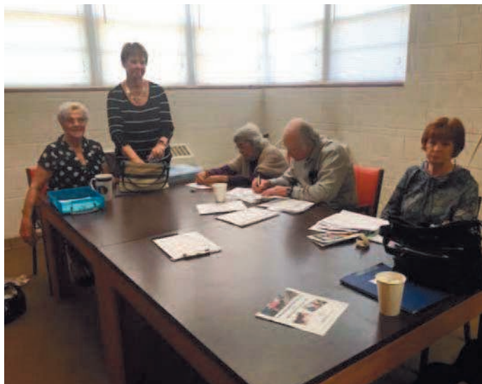
SECA meets at the Downtown Senior Center the first Friday of each month.