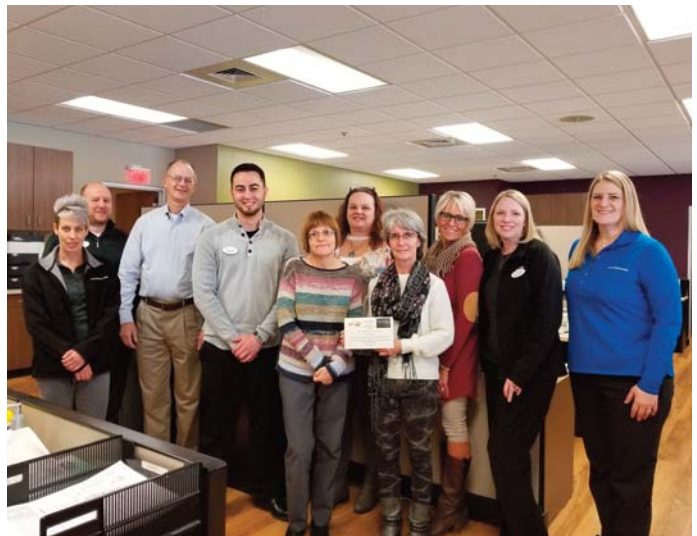
Senior Services made and presented some pies to the Davis Moore group to thank them for their commitment to Senior Services and especially for delivering Meals on Wheels.

To find out more about Senior Services or to help with the campaign, call 316.267.0302.