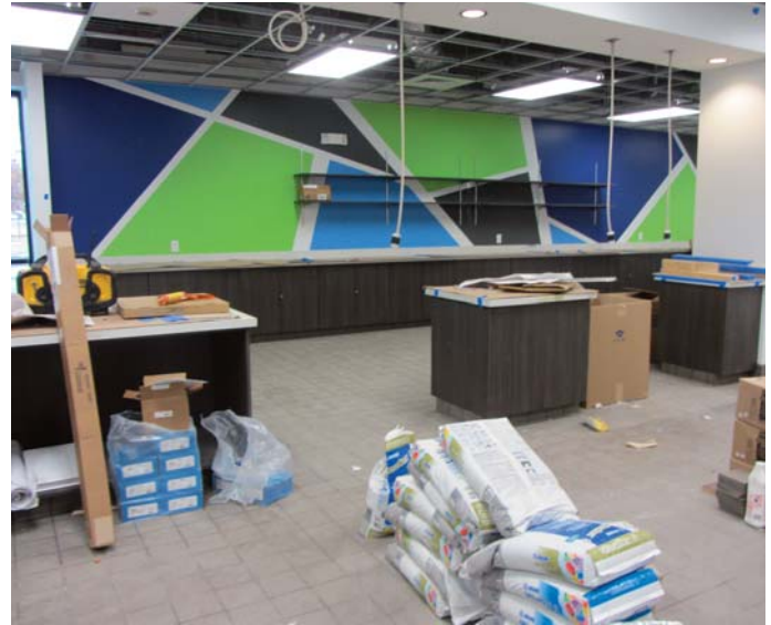
Work on the new Meals on Wheels kitchen and office area is nearing completion.