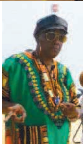
The Northeast Senior Center hosted Motown Madness June 2 at the Boys and Girls Club. Everyone enjoyed an evening filled with singing, dancing and dining.