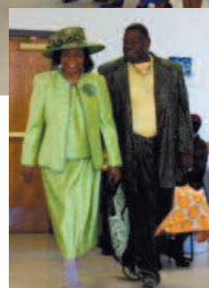
NESC models in the Mother’s Day fashion show.